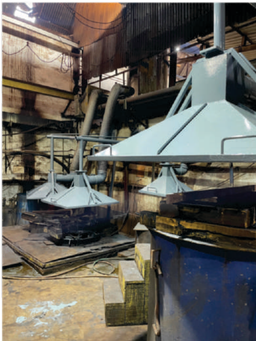
Customised Rotating Capture Hoods